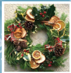
Fresh Holly Wreaths